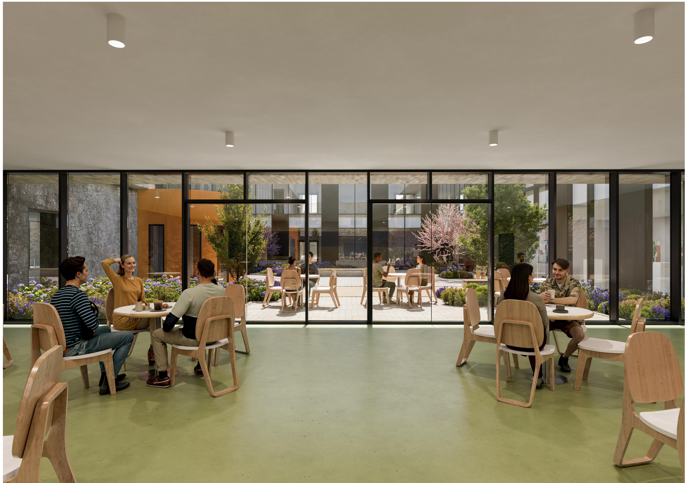
200-bed Adult In-Patient Hospital Public Canteen

COPYRIGHT: The design and details shown on this drawing are applicable to The Named Project only and may not be; reproduced, modified or relayed in whole or part or be used for any other project or purpose without the prior written permission of TOT Architects with whom copyright resides. DO NOT SCALE this drawing. Use figured dimensions only. The Contractor is responsible for checking all levels and dimensions on site prior to commencement of works. Any discrepancies are to be referred to the ARCHITECT. Drawings to be read in conjunction with all other Consultants Drawings & Specifications were relevant. Proprietary items shall be fixed in strict accordance with the Manufacturer's Instructions. Sizes of proprietary items shall be checked with Manufacturer.